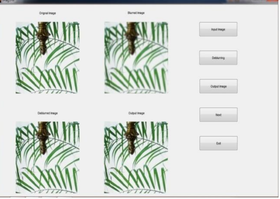
Fig. 3 Result using gaussian blur